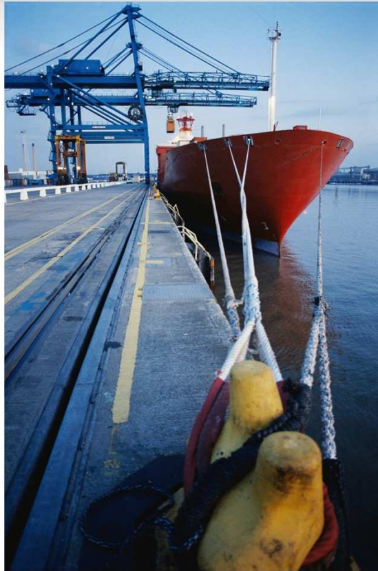
Ship to Shore Cranes