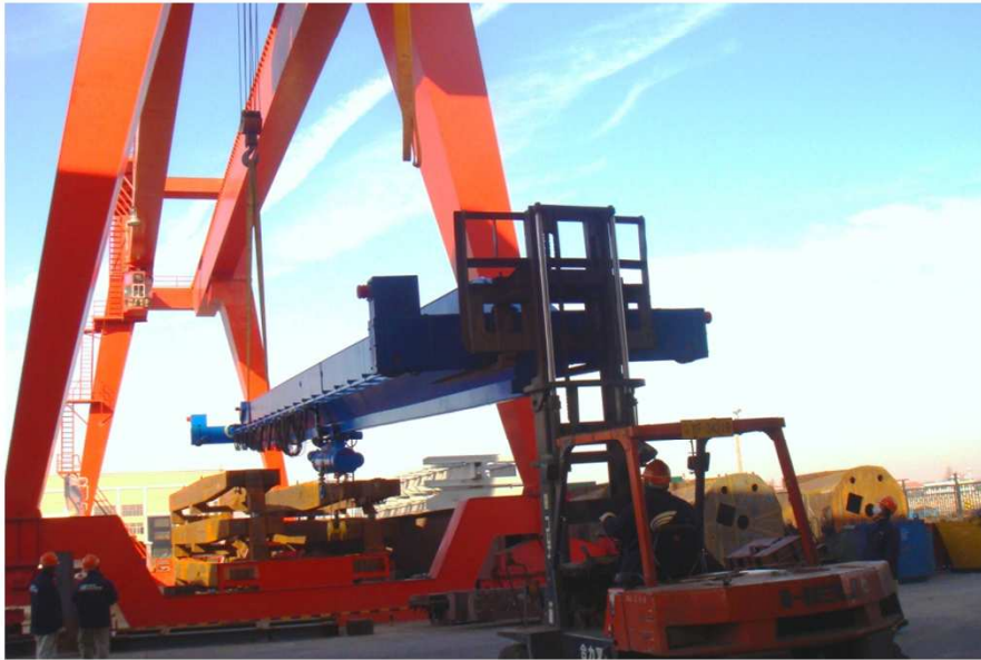
Bridge Cranes and Gantry Crane