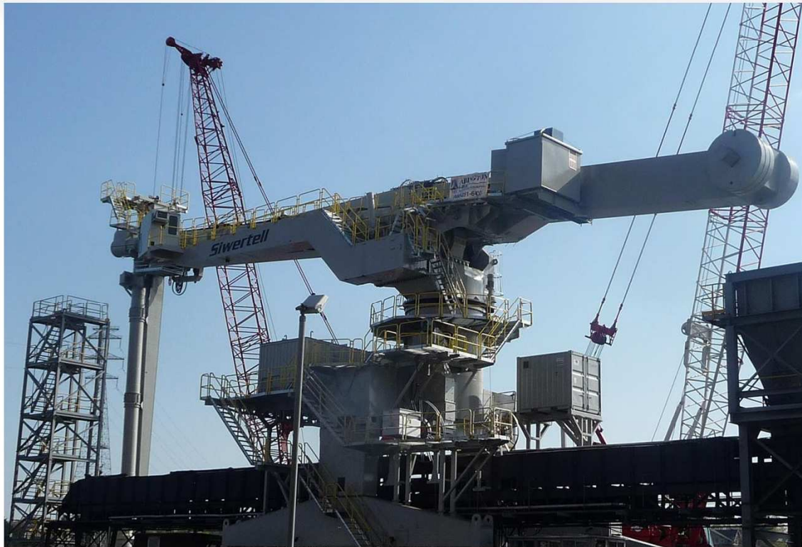
Continuous Self-unloader is mainly used in large terminal for bulk cargo, current major customer is Cargotec (Sweden).